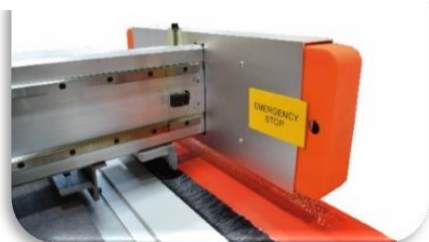
Efficient security systems